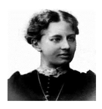
Step 1: Learn about a woman who was not afraid to be a first in the field of mathematics.

Sonia Kovalevsky was the first woman in Europe to hold a doctorate in mathematics and one of the first women to work for a scientific journal as an editor.