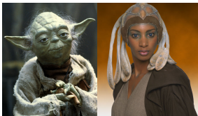
Yoda and Adi Gallia

Padawan: Force-sensitive, train in the Jedi Order to one day become a Jedi. [Wookieepedia]